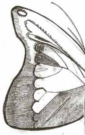
Youth participant Lidiya B. shares her poem she wrote during the Private Eye workshop:

In addition to leadership workshops, participants also enjoyed environmental observation activities from educators like Melanie Beck, the Environmental Educator at the Santa Fe Children's Museum . In her "Private Eye" workshop participants looked at butterflies through a magnifying glass and were instructed to draw and write about what they observed.