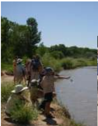
Rio Grande R&S “One for the River” Project