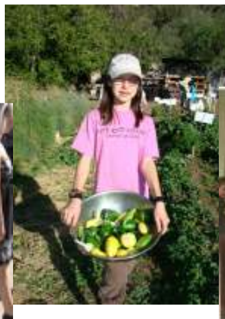
Organic gardening at Reeves Mountain