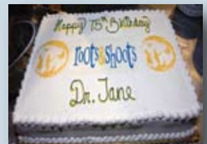
- By Hallie T. W., Roots & Shoots Four Corners Council Member

The wind is blowing now Outside my window The sun is shining Too And flowers are blooming on all the fruit trees Gentle honey bees drift from blossom To blossom And the Kingbird tries to eat a worm The ground is dry, from rain Or lack thereof And only small plants grow here Low to the ground, except for the cholla, With painful needles, and colorful flowers And the Meadowlarks That sit on the cholla, or Junipers And sing No Chimpanzees here Or monkeys at all But there is magic that only the desert holds Magic of watching a moon blossom open Magic of hearing the voices of life Magic of feeling a warm, breathing earth under you, And an open, strong sky above you Magic of knowing Magic itself Stronger than anything And the bird cries not disturbing but adding to the stillness Here In my home My beautiful New Mexico